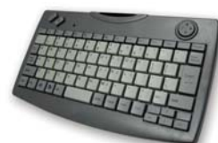
Infrared Remote Keyboard